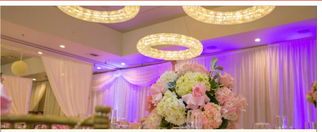
Crystal Grand Ballroom A series of 4 smaller rooms combined featuring traditional décor with large chandeliers, floor to ceiling windows & a large outdoor patio. Capacity ideal for conventions, concerts, & other large scale events.