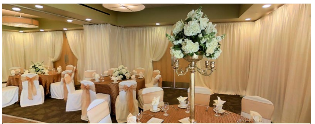
Salon Event Room. An intimate banquet room located on the first floor adjacent to the Golf Course, the Salon Room features both contemporary & natural lighting with a view of the Cielo Garden Event Lawn & Bella Verde Golf Course.