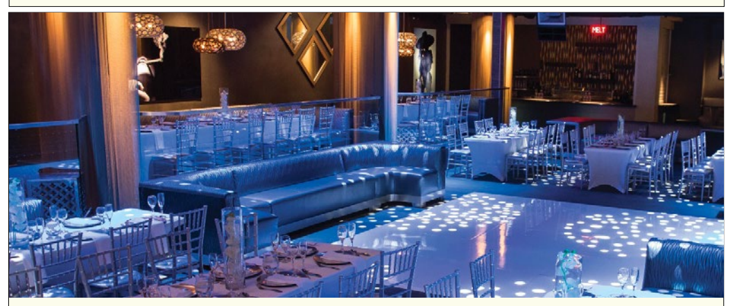
Lit Nightclub. Exclusive nightclub environment with optional powerful sound equipment, built-in wood dance floor, DJ booth, lounge seating, impressive artwork and a beautiful outdoor cocktail or mingling area for guests.