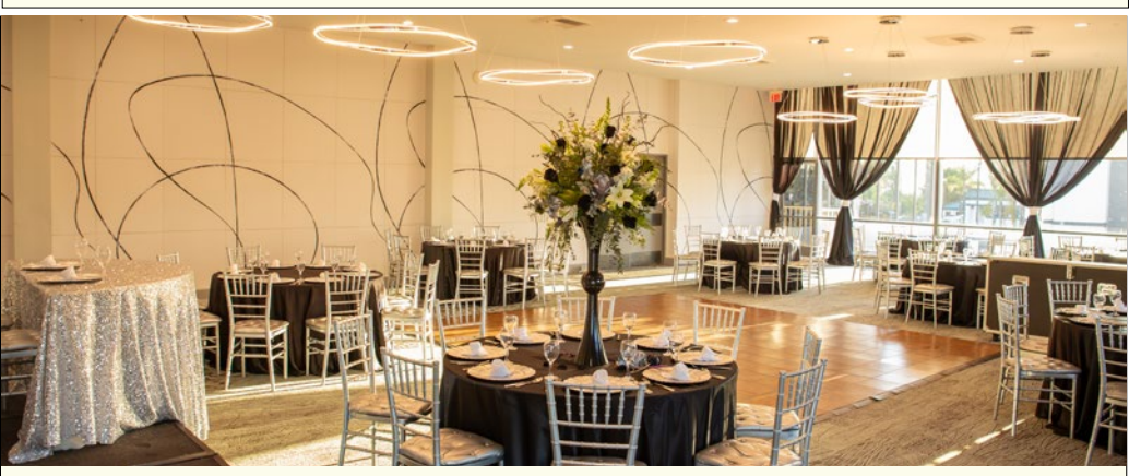
Sunset Event Room . Features a panorama view & floor to ceiling windows overlooking the Golf Course. This charming room has unique chandeliers & a bar easily accessible in the foyer making it an ideal complete event space.